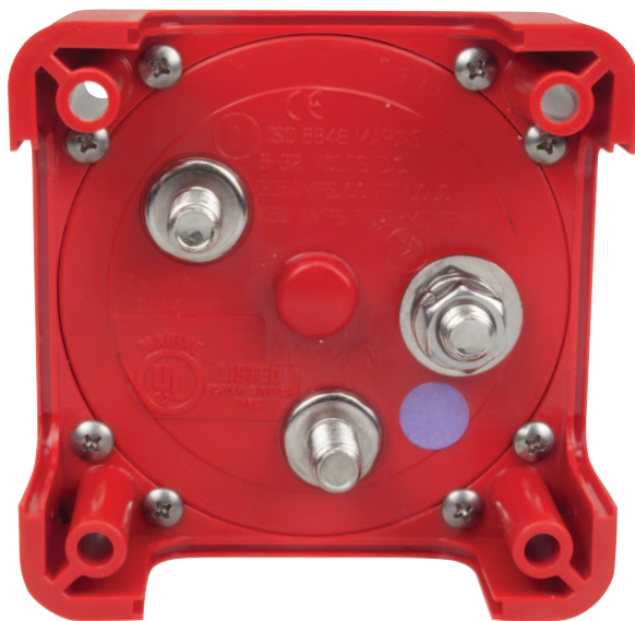
Accessory Tap shown installed with wire terminal (not included)