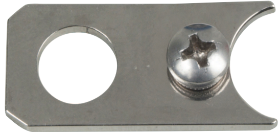
Fig. 8510 Accessory Tap